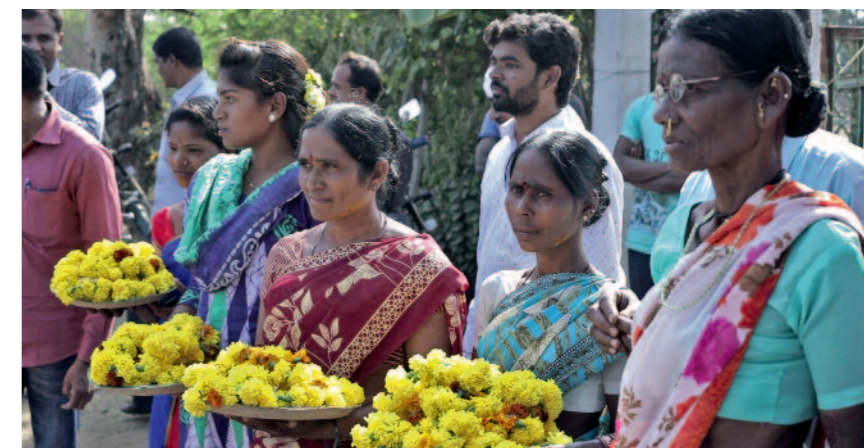
A warm welcome from the village community awaited the 2017 travel group.

Dibella was able to present the result of a completely transparent supply chain to its customers for the first time at Texcare 2016, proving that it keeps its promises. In December 2018, we are offering interested customers the great opportunity of immersing themselves in our – and hence also their own – textile supply chain. A number of textile service companies are now making use of this offer and will be accompanying Dibella on a business trip to India. It has been scheduled for December to coincide with the typical harvest time for cotton.