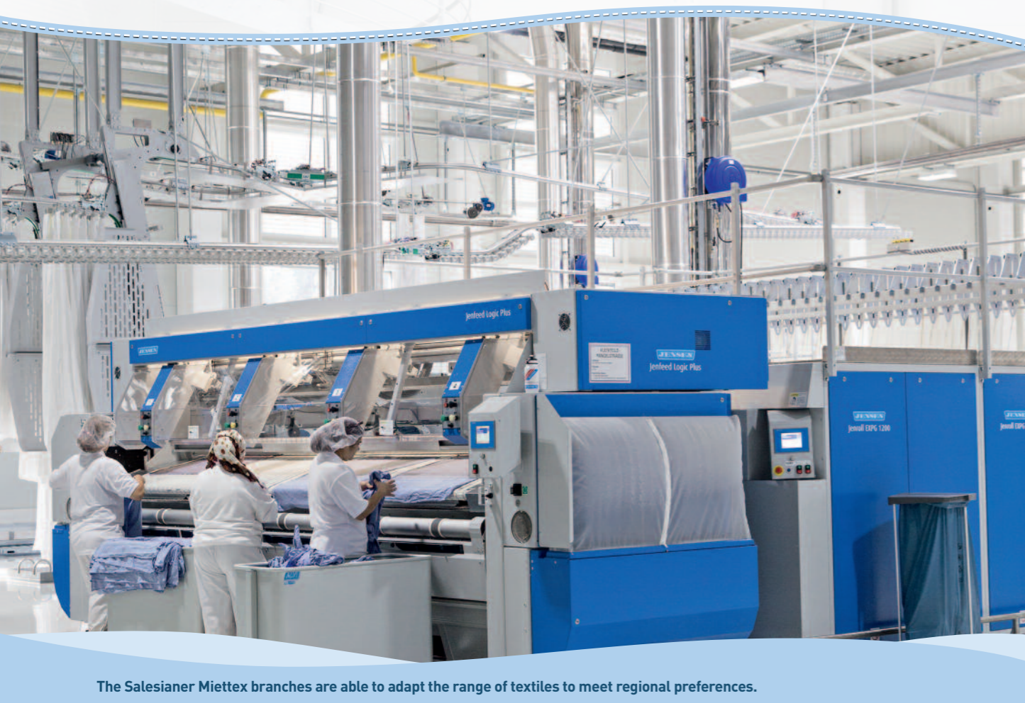
The Salesianer Miettex branches are able to adapt the range of textiles to meet regional preferences.