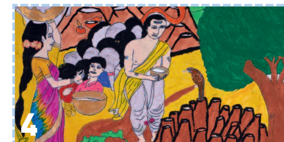
The GoodTextiles Foundation helping school students to pay for a dance teacher