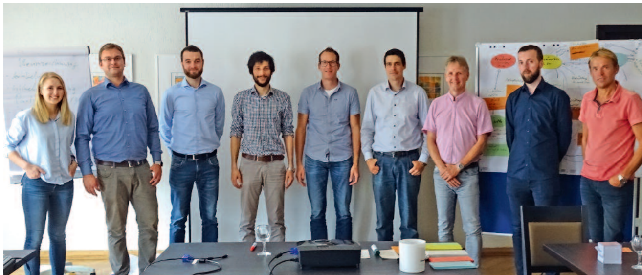
Dibella held its first digitalisation workshop with external partners at the end of August.

unimpeded flow of data. All the team members attend regular workshops to achieve this goal. These workshops have proved to be an ideal, results-oriented platform and are also the perfect choice for joint activities with external partners. The first workshop of this type was held at the end of August 2018. To this end, Dibella invited its long-standing logistics partner Hamacher and the Fraunhofer Institute for Material Flow and Logistics IML (Dortmund) to work on joint solutions for tracking deliveries from their arrival at the port of Rotterdam on an end-to-end and real-time basis. Previously, there were a number of obstacles in the way of this project. Now that they have been identified, they are to be removed, thus allowing the goods to be traced more simply and more quickly.