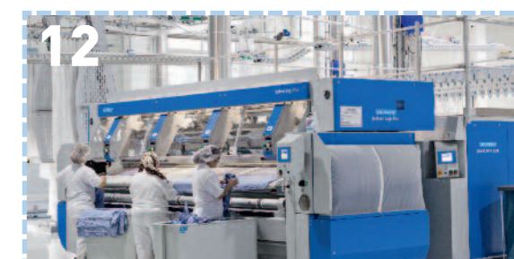
Salesianer Miettex takes care of the textile needs of its customers in nine countries and in 30 companies.