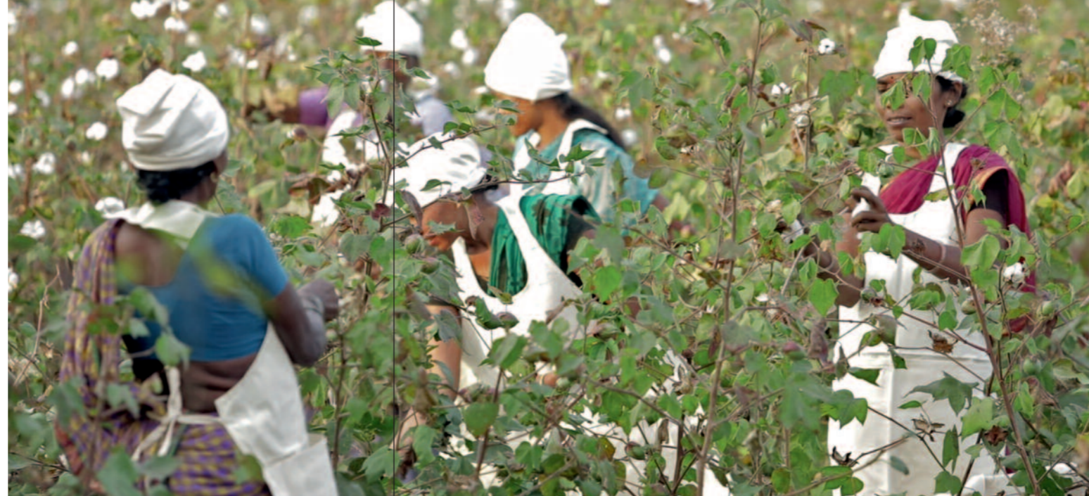
The fibres are picked by hand at organic cotton plantations in India.

• No genetic engineering: Manipulating the genetic material of cotton plants triggers a spiral of dependencies. The seeds for non-reproductive genetically modified cotton (GMO) are basically only offered by a single producer who is able to determine the world market price. This makes financial dependencies almost inevitable. As genetically non-modified plants, by contrast, usually remain capable of reproduction, the cotton farmers are free to determine the seeds and varieties that they want to use. In addition, plants that have not been